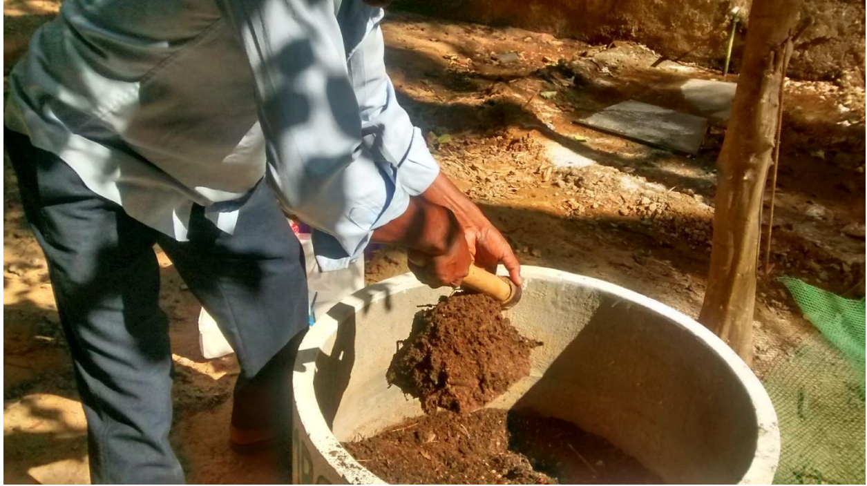
Planting Canna in contaminated soil in Campus