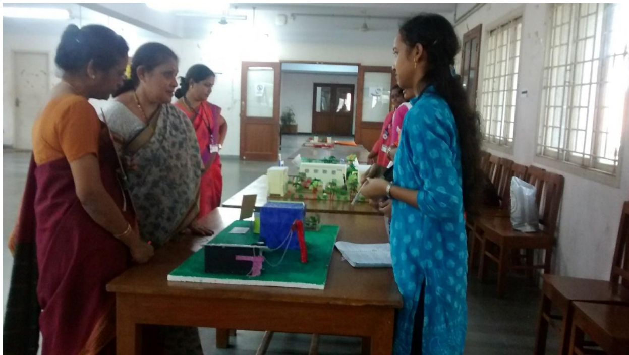
Vanamahotsav Week Celebration – Poster Competition