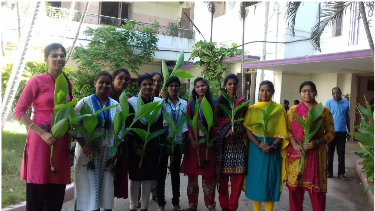
Environmental awareness – Competition