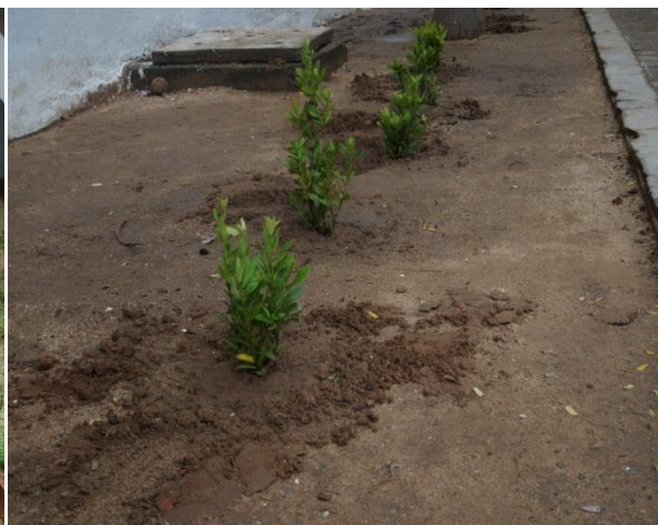
Commemoration of the Remembrance Day of Dr.A.P.J.Abdul Kalam in front of Founder's statue in Campus II (Floral saplings and Crotons in pots)