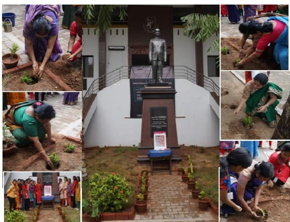
Principal, Vice Principals, Dean and Faculty at the planting site - A tribute to Dr.A.P.J.Abdul Kalam