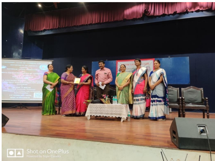
National level symposium on ‘Green Energy Principles in Cosmology’