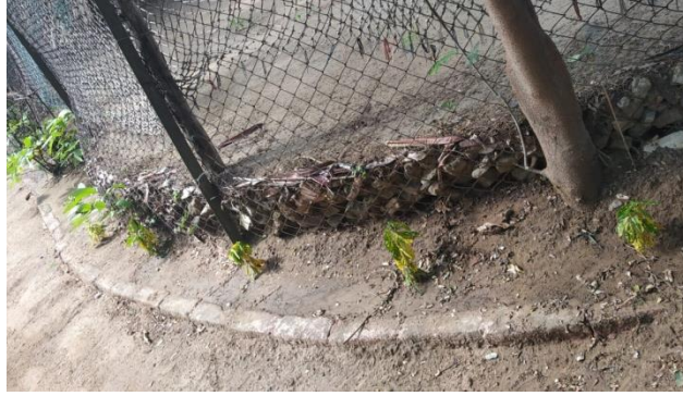
Crotons along the road from Main Gate in Campus I

Note: The members of the League do regular watering and trimming of the plants in both Campus I and Campus II as part of regular activity in maintaining the flora of the Campuses.