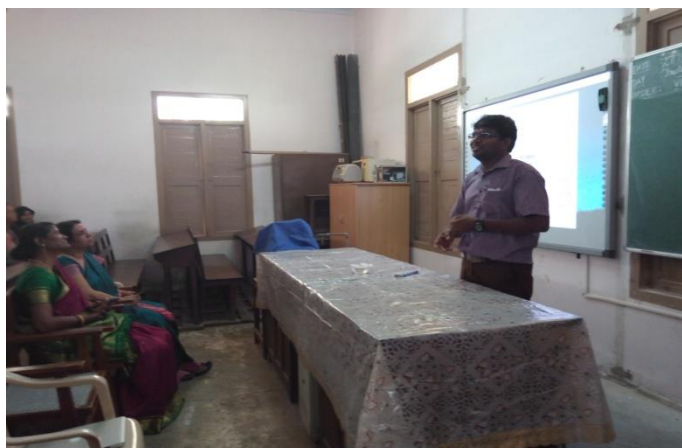
Lecture on Basics of Sky Watching.