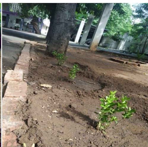
Floral Saplings in the garden area near the Main Gate in Campus I