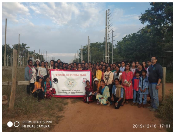
Field trip to Gauribidhanur observatory, Bangalore