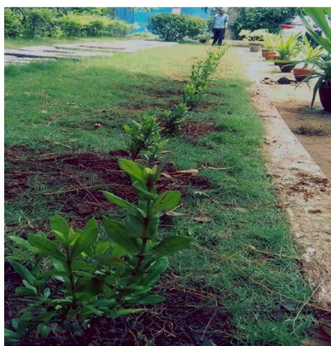
Floral Saplings in front of the Administrative Block