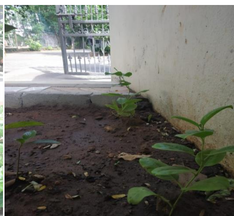
Crotons and floral saplings near the Main Gate in Campus I