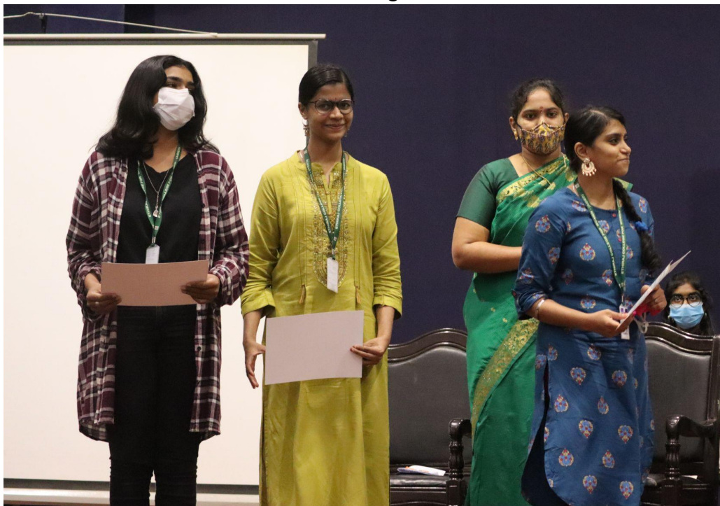
First Runner Up of the Ethiraj-Integrated Stock Market Challenge