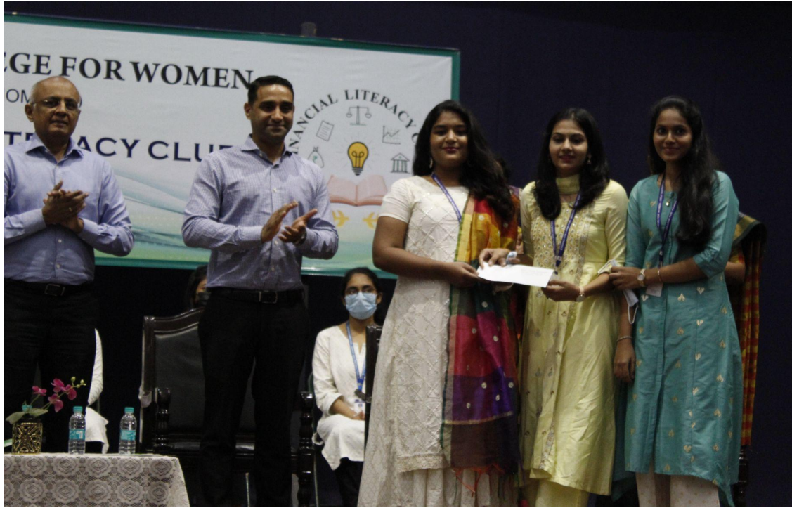
Second Runner Up of the Ethiraj-Integrated Stock Market Challenge