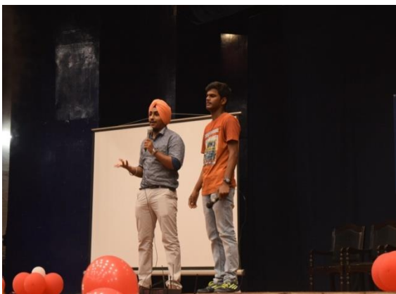
Students from other colleges participating in the Events.