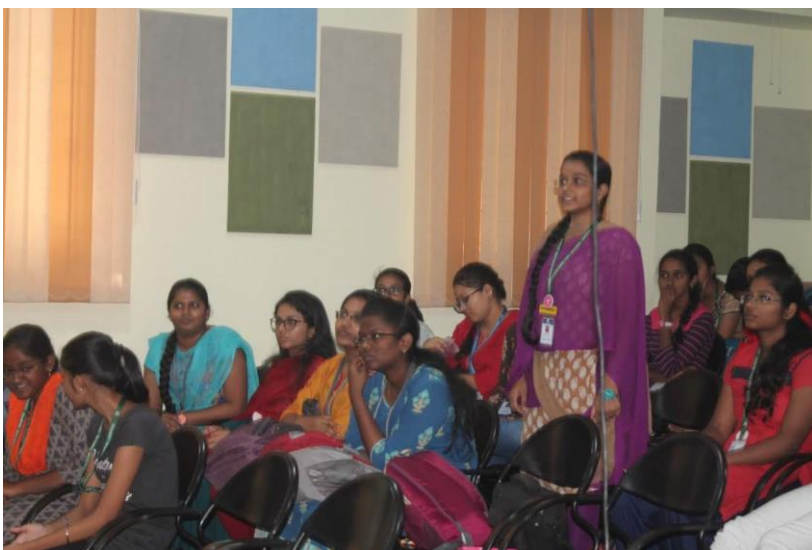
Students Actively participating in the Workshop