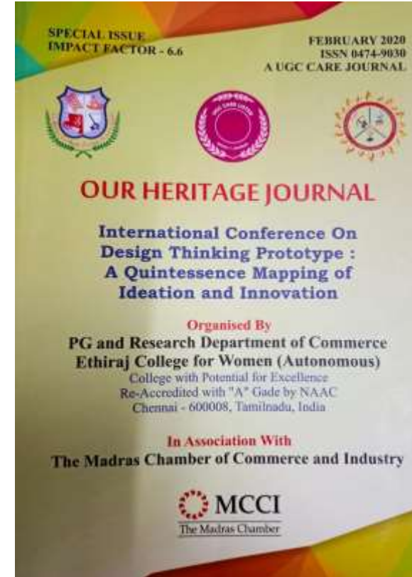
IC 2020 - JOURNAL