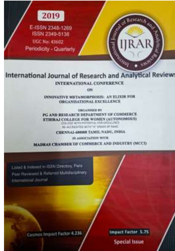
IC 2019 - JOURNAL