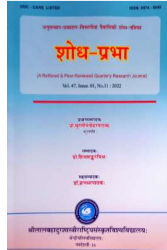
IC 2022 – JOURNAL