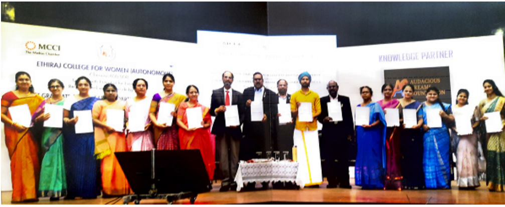
Inaugural of International Conference on Circular Economy