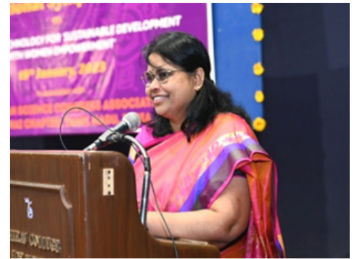
The guest speaker addressing audience