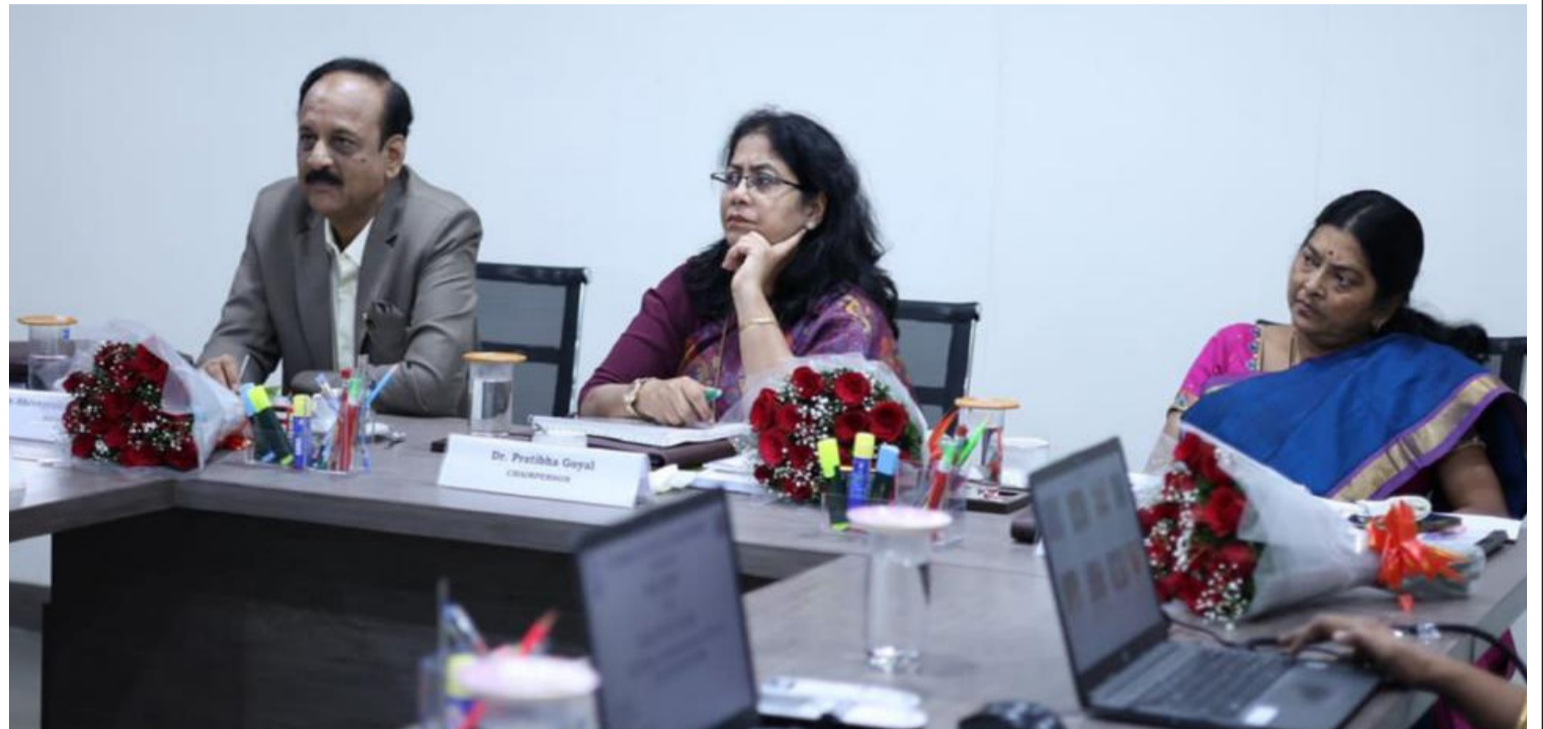
The Peer Team of NAAC Cycle IV