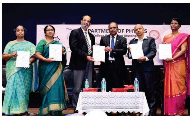
ECW student honored with Circle of Excellence Award