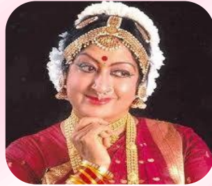
Padma Vibhushan Dr. Padma Subrahmanyam

Artist & Dancer Director Nitrodaya Chennai, India