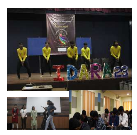
384<sup>th</sup> Madras Day Celebrated

The online events such as Poster Making and Ballyhoo (Advertisement Making) were conducted earlier. Day 2 was an inter class event where the students and alumnae of the department participated in various Onstage events such as Best Manager, Adzap and Potpourri and Shipwreck. Various Offstage events such as Treasure Hunt, Poster Making and Photography were conducted earlier. At the end of the event all the committee members were recognized for their contribution for making Idara a successful event.