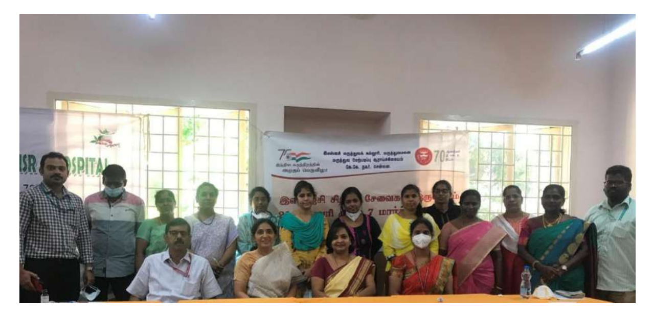
Team of Doctors and the IQAC