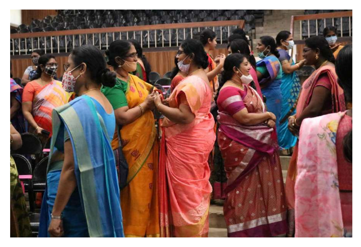
Participants enjoying the Ice breaker game