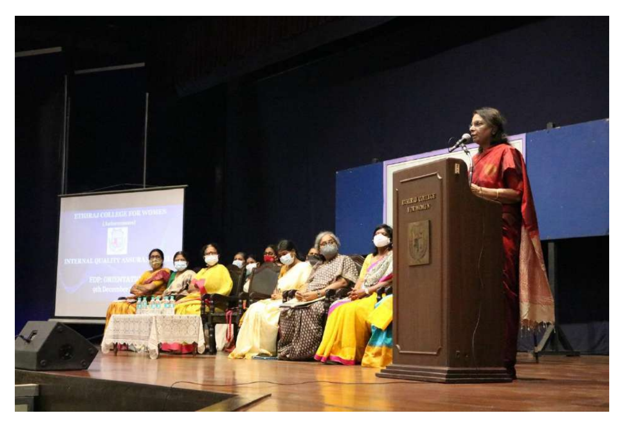
Chairperson addressing the Newly appointed Faculty members.