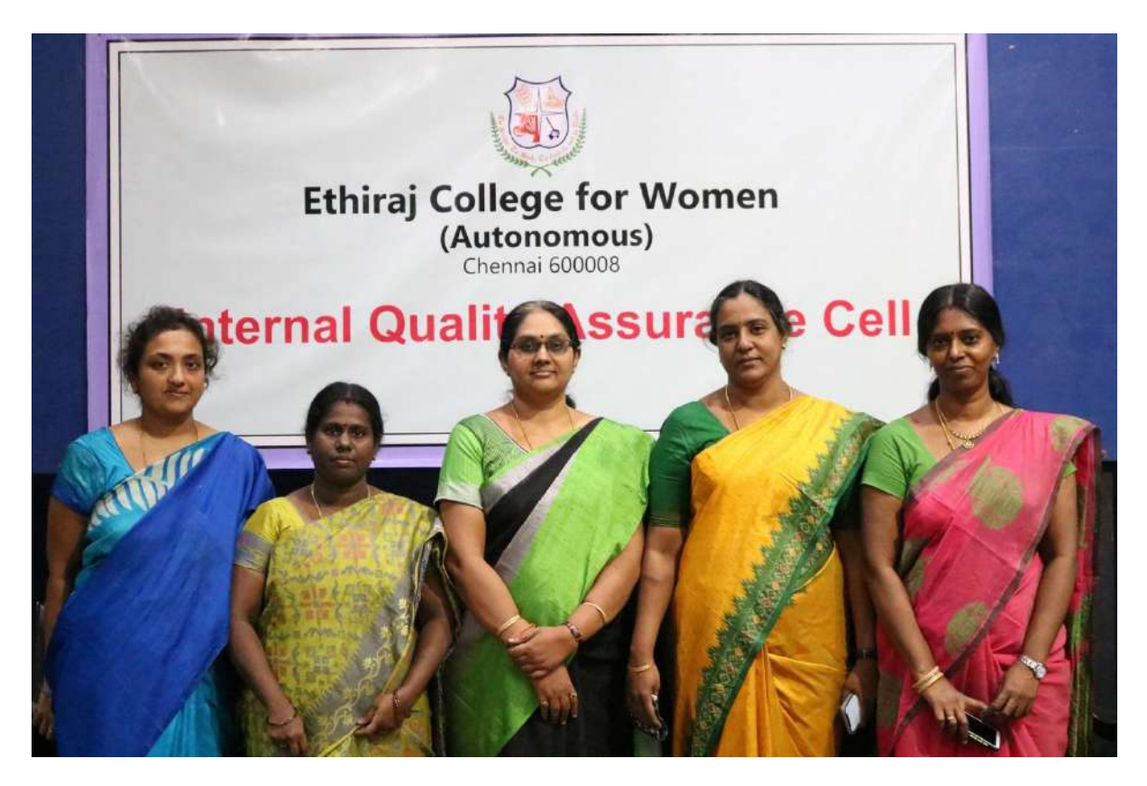
IQAC Team- Coordinators of the Orientation