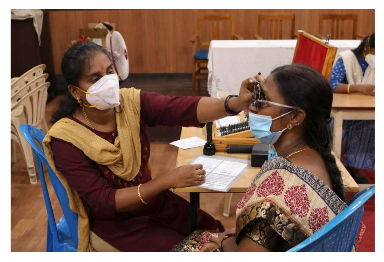
ESIC Insured member undergoes an Eye-check up.