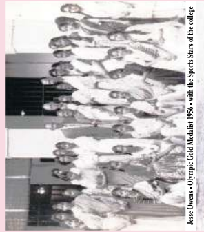
Jose Owens - Olympic Gold Medalist 1956 - with the Sports Stars of the college