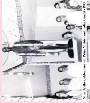
Silver Jubilee Celebrations with Prime Minister Smt. Indira Gandhi - 1973