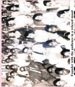
Founder with the audience in a relaxed mood