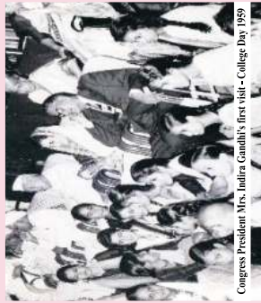
Congress President Mrs. Indira Gandhi's first visit - College Day 1959