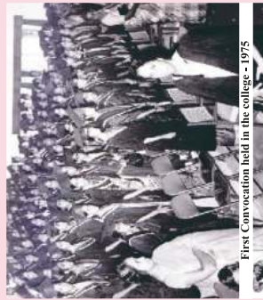
First Convocation held in the college - 1975