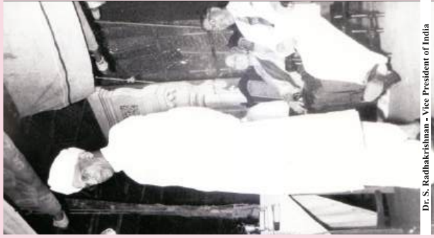
Dr. S. Radhakrishnan - Vice President of India