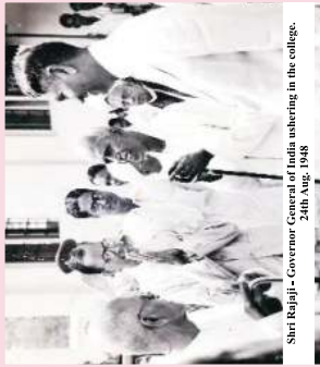
Shri Rajaji - Governor General of India 28th Aug. 1948