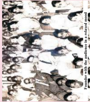
Founder with the audience in a relaxed mood