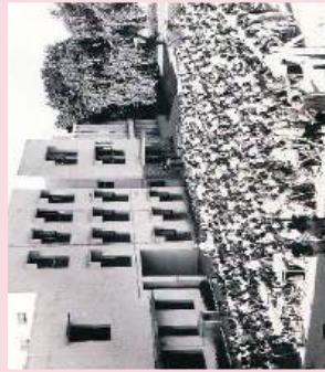
First Convocation held in the college - 1975