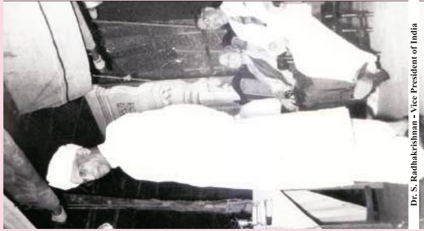
Dr. S. Radhakrishnan - Vice President of India