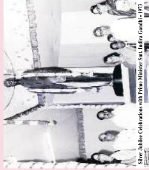
Shree - Jubilee Celebrations with Prime Minister Smt. Indira Gandhi - 1973