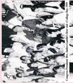
Congress President Mrs. Indira Gandhi's first visit - College Day 1959