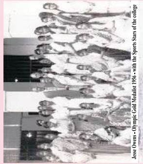
Jose Owens - Olympic Gold Medalist 1956 - with the Sports Stars of the college